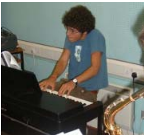
Cookin' at 80 Queen Street!